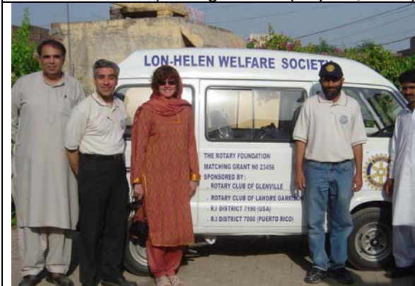
Van/ambulance display in the Kujer village (Apr 28, 2005)