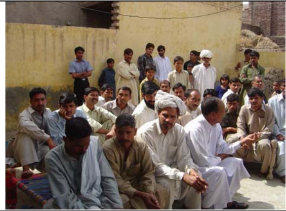
Gathering of the Kujer villagers to discuss Matching Grant projects (Mar 7, 2004)