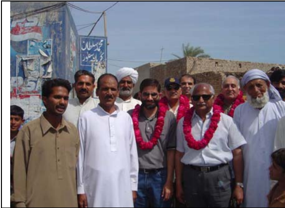
Kujer villagers welcoming Rotarians (RC Lahore Garrison) with garlands (Mar 7, 2004)

Local Sponsor: Rotary Club of Lahore Garrison (R.I. District 3270) International Sponsors: Rotary Club of Glenville (USA), R.I. District 7190 (USA) and R.I. District 7000 (Puerto Rico)