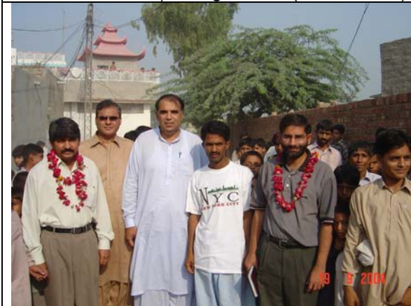
Kujer villagers welcoming Rotarians (RC Lahore Garrison) with garlands (Sep 19, 2004)