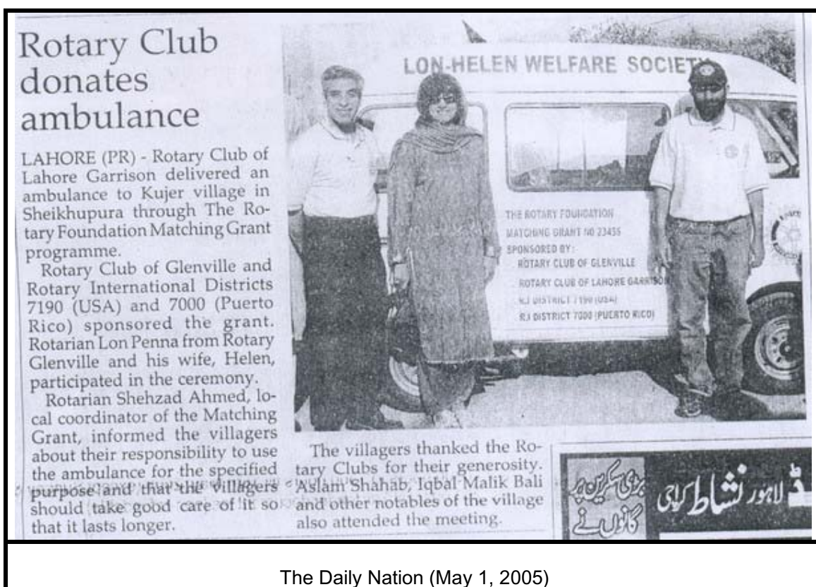
The Daily Nation (May 1, 2005)